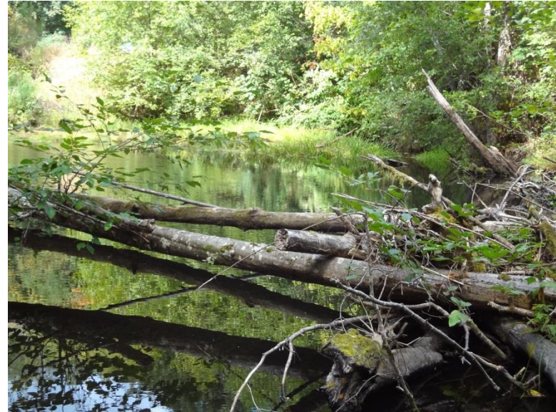
Proposed upstream log placement area