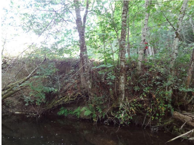
General stream conditions at site