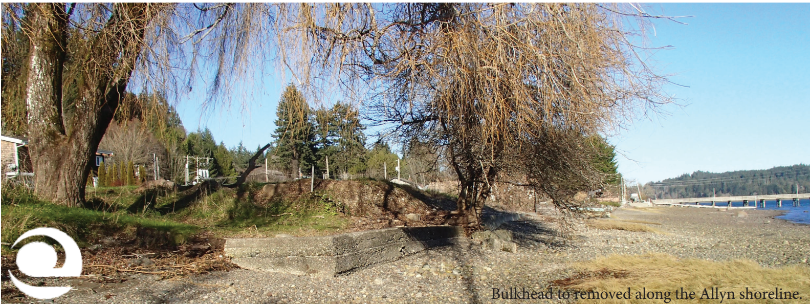
Bulkhead to removed along the Allyn shoreline.