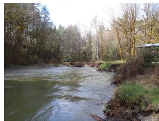
Windle Bank Erosion