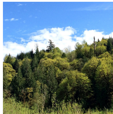
Images from Skokomish Survey