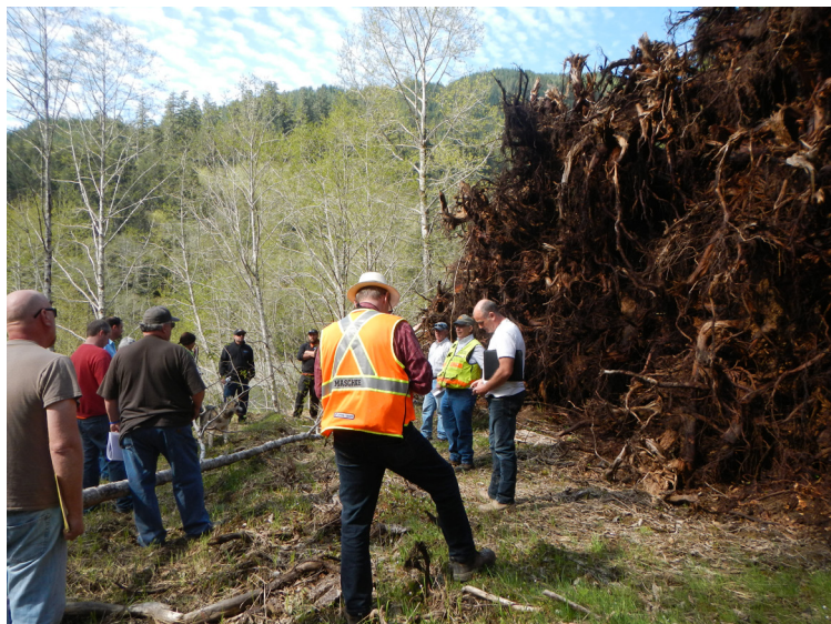
Skokomish South Fork LWD Phase 3 Project Mandatory Pre-Bid Walkthrough