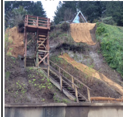
Shoreline bluff planting project using SFM Mini Grant