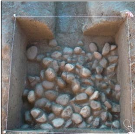
Underground oven.