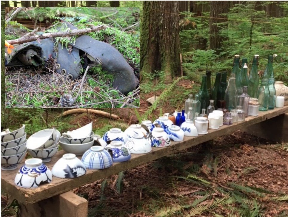
Main Image: Dishes, bottles, workboot found at the North Shore Japanese bath house (ofuro) site, Courtesy Bob Muckle, Archaeologist, Capilano University, B.C. This is an example of an above ground resource.