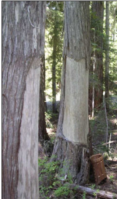
Left and Below: Culturally modified tree and an old carving on an aspen (Courtesy of DAHP).