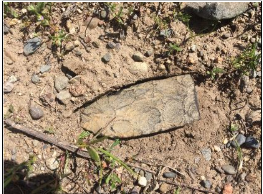
Biface-knife, scraper, or pre-form found in NE Washington. Thought to be a well knapped object of great antiquity.