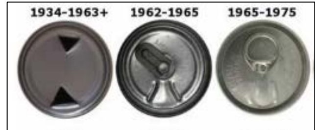
Can opening dates, courtesy of W.M. Schroeder.